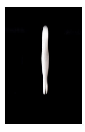
ULM series Untitled 1, São Paulo, 2024 Print on cotton paper 60 x 40 cm Edition of 20