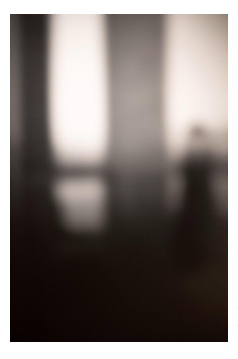
ULM series Untitled 9, London, 2023 Print on cotton paper 30 x 20 cm 3/20