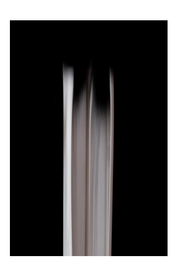
ULM series Untitled 4, São Paulo, 2024 Print on cotton paper 60 x 40 cm Edition of 20