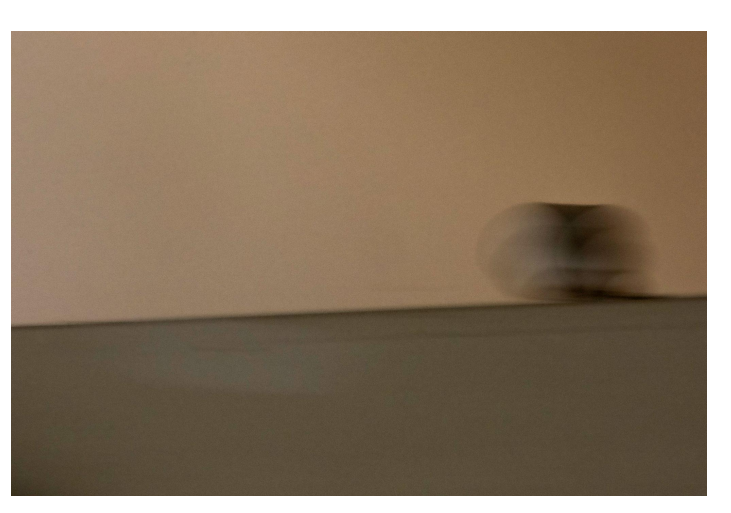
ULM series Untitled 10, São Paulo, 2024 Print on cotton paper 20 x 30 cm Edition of 20