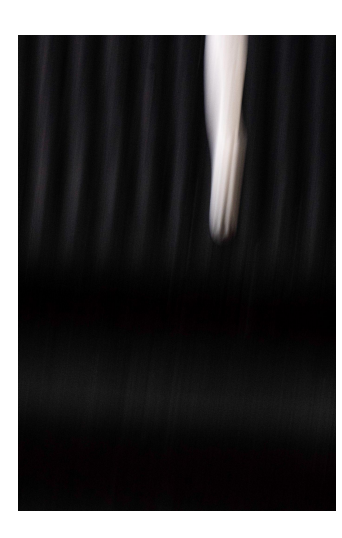
ULM series Untitled 2, São Paulo, 2024 Print on cotton paper 60 x 40 cm Edition of 20