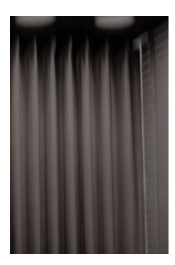
ULM series Untitled 2, São Paulo, 2023 Dye sublimation print 60 x 40 cm Edition of 20