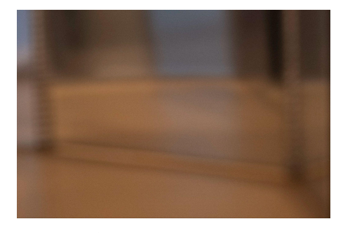
ULM series Untitled 17, São Paulo, 2024 Print on cotton paper 29,7 x 42 cm Edition of 20