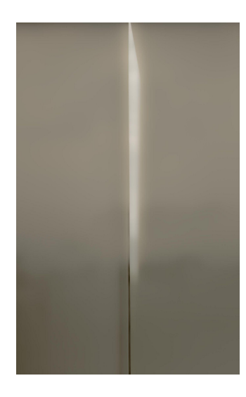
ULM Series Untitled 1, Marfa, 2022 Dye sublimation print 120 x 80 cm Edition of 20