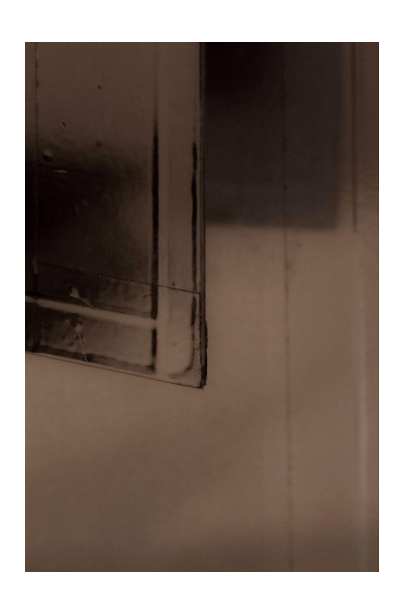
ULM series Untitled 11, São Paulo, 2024 Print on cotton paper 60 x 40 cm Edition of 20