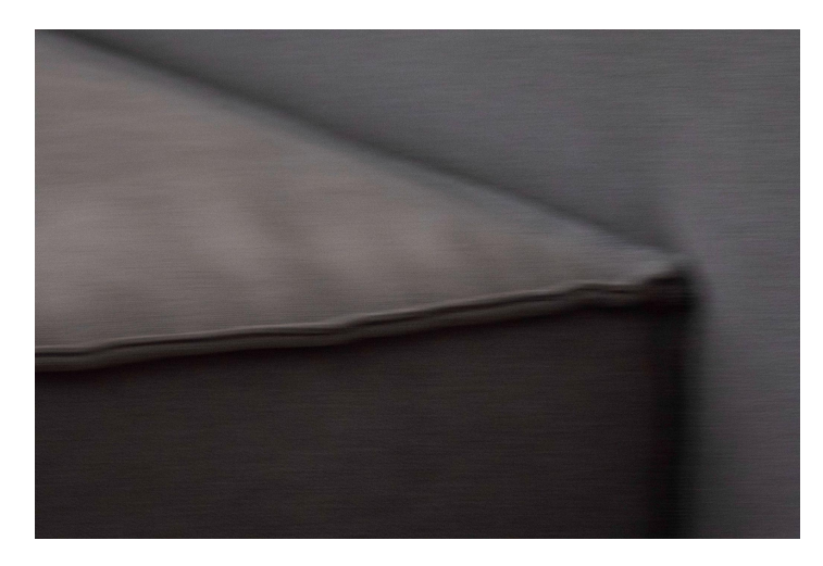
ULM series Untitled 5, São Paulo, 2024 Print on cotton paper 100 x 67 cm Edition of 20