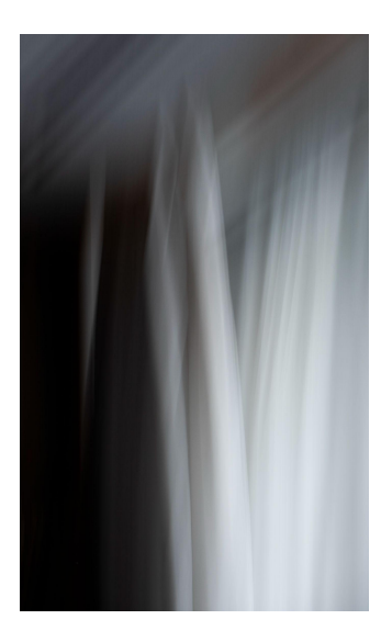
ULM series Untitled 8, Rio de Janeiro, 2022 Dye sublimation print 60 x 40 cm Edition of 20