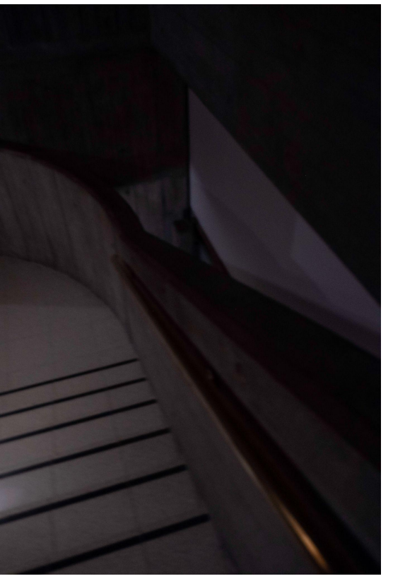
ULM series Untitled 10, London, 2023 Print on cotton paper 30 x 20 cm Edition of 20