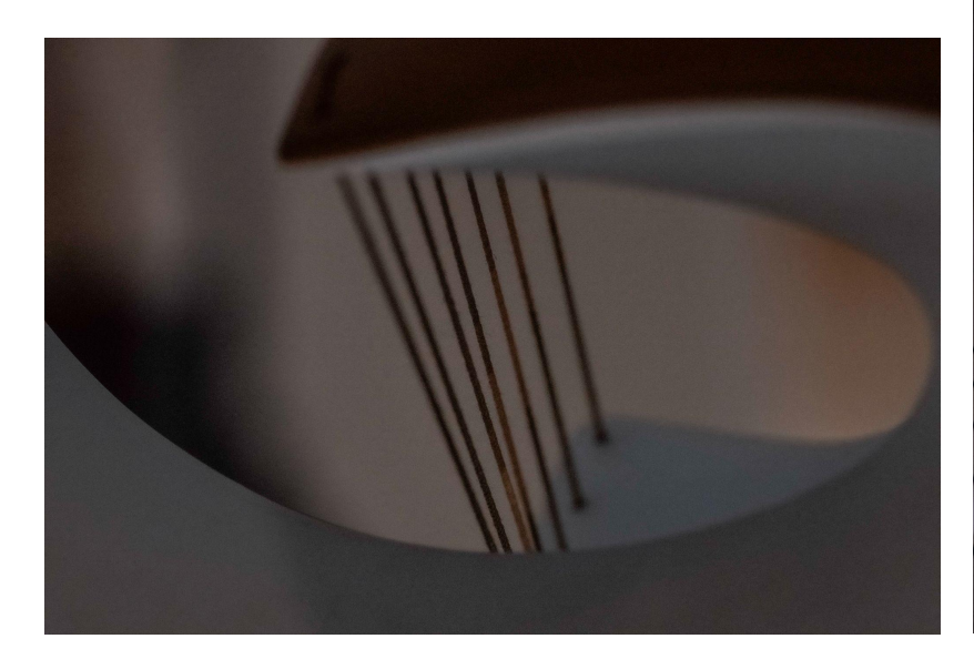
ULM series Untitled 11, London, 2023 Print on cotton paper 20 x 30 cm Edition of 20