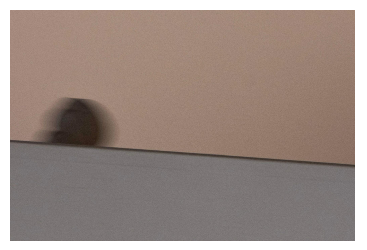
ULM series Untitled 9, São Paulo, 2024 Print on cotton paper 20 x 30 cm Edition of 20