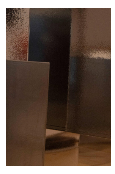
ULM series Untitled 16, São Paulo, 2024 Print on cotton paper 60 x 40 cm Edition of 20